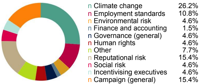
Engagement by topics