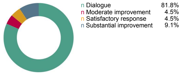
Engagement by outcomes